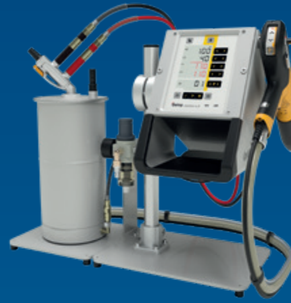
OptiFlex® Pro L