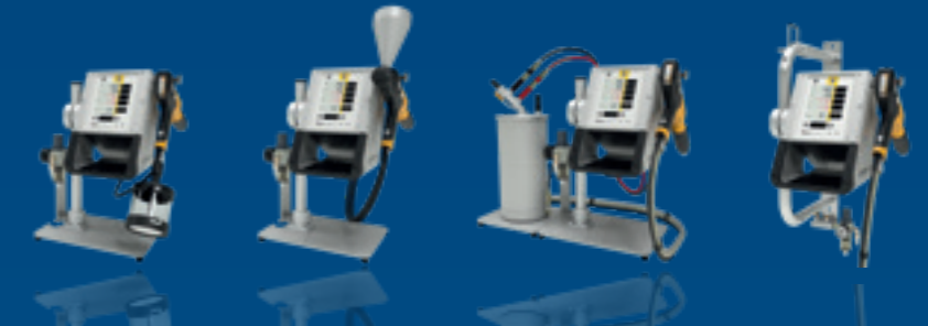
OptiFlex® Pro C OptiFlex® Pro CF OptiFlex® Pro L OptiFlex® Pro W