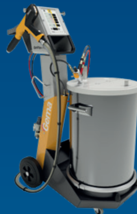
OptiFlex® Pro F