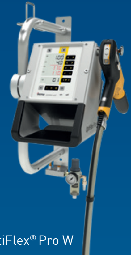
OptiFlex® Pro W