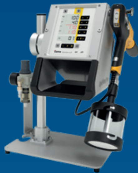
OptiFlex® Pro C