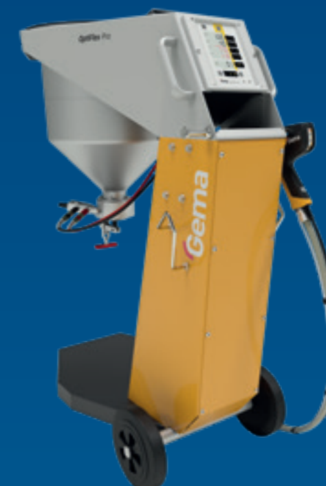
OptiFlex® Pro S