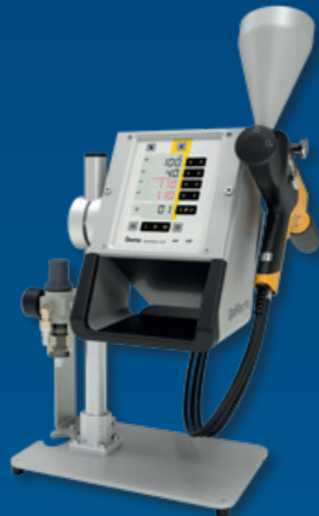
OptiFlex® Pro CF