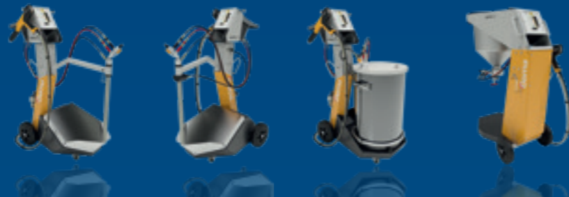
OptiFlex® Pro B OptiFlex® Pro Q OptiFlex® Pro F OptiFlex® Pro S