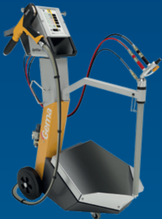
OptiFlex® Pro B