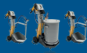
OptiFlex® Pro Manual coating equipment