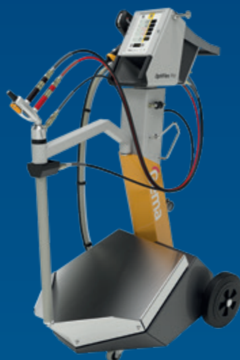
OptiFlex® Pro Q