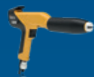
OptiSelect® Pro Type GM04