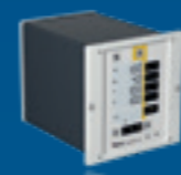
OptiStar® Type CG21