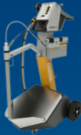
OptiFlex® Pro B Spray